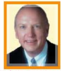
Mark Victor Hansen